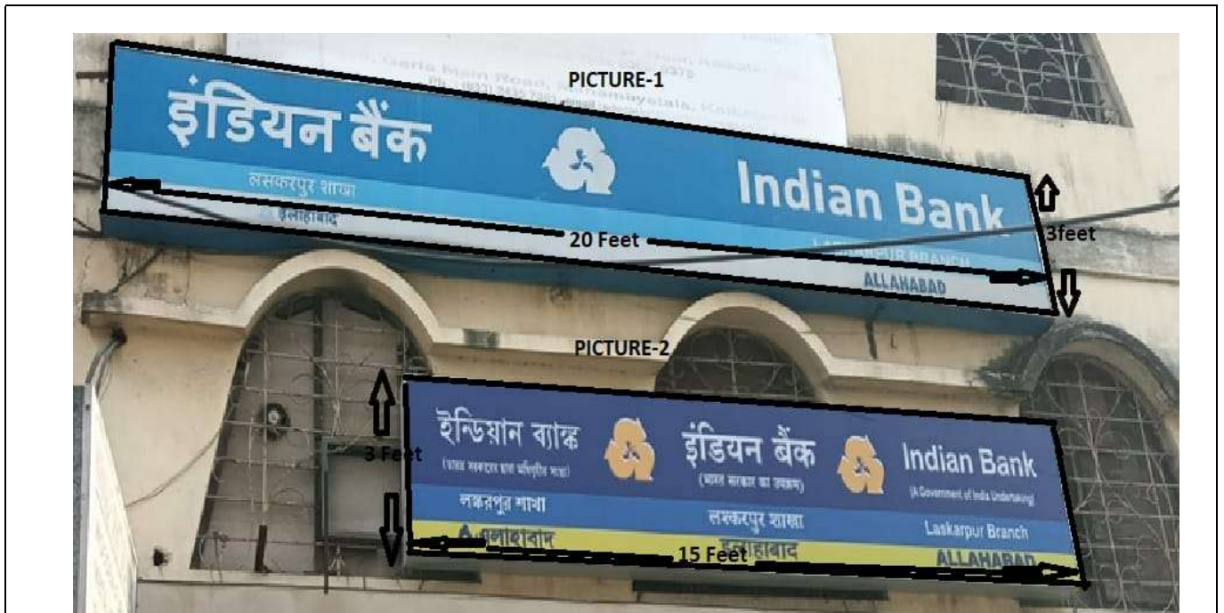
PROPOSED LOCATION (SUBJECT TO APPROVAL)