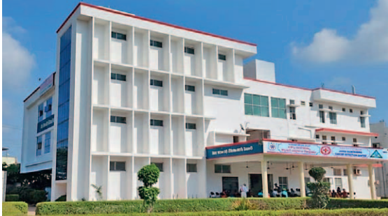
The surgical oncology department performs over 1,000 complex cancer surgeries annually at IRCS, Nellore.